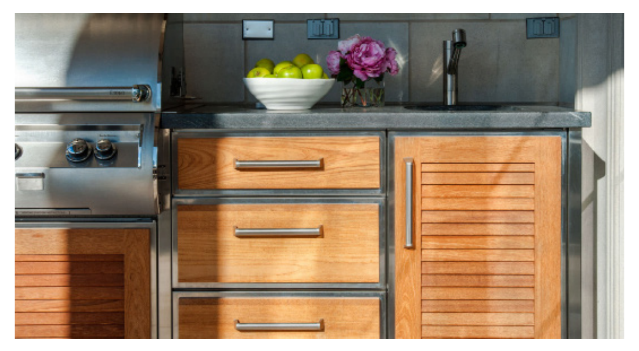
cont'd from previous page

15-20 minutes. Scrub surface with a hard bristle brush for 15-20 minutes to help remove mill glaze or weathering. Do not allow solution to dry on the wood surface.